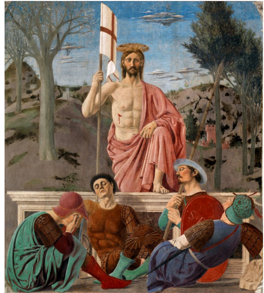
The Resurrection, Piero della Francesca, c. 1460s

The Lord is truly risen, alleluia! To him be glory and power for all the ages of eternity, alleluia, alleluia!